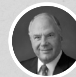
ELDER RONALD A. RASBAND sustained: 2015