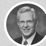
ELDER D. TODD CHRISTOFFERSON sustained: 2008