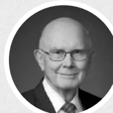
PRESIDENT DALLIN H. OAKS 1st Counselor sustained as an Apostle: 1984