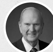
PRESIDENT RUSSELL M. NELSON President of the Church sustained as an Apostle: 1984