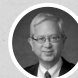
ELDER GERRIT W. GONG sustained: 2018