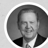
ELDER JEFFREY R. HOLLAND sustained: 1994