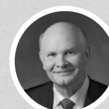
ELDER DALE G. RENLUND sustained: 2015