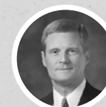
ELDER DAVID A. BEDNAR sustained: 2004