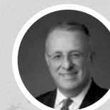
ELDER ULISSES SOARES sustained: 2018