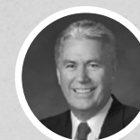
ELDER DIETER F. UCHTDORF sustained: 2004