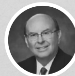
ELDER QUENTIN L. COOK sustained: 2007