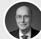
PRESIDENT HENRY B. EYRING 2nd Counselor sustained as an Apostle: 1995